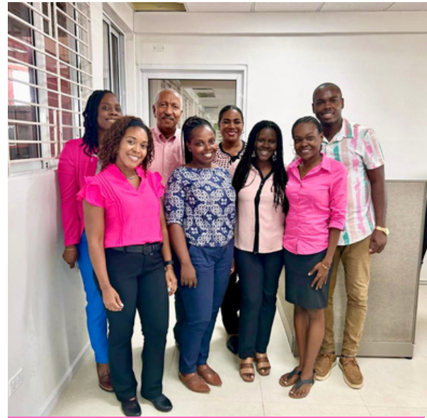
Lecturers unite in pink for Breast Cancer Awareness Month, showing solidarity and support for those affected by breast cancer. Together, we raise awareness and promote early detection!

This initiative reflects our commitment to not only academic excellence but also supporting important causes within our community. We thank everyone who contributed to this meaningful effort and continue to encourage awareness, early detection, and support for those impacted by breast cancer.