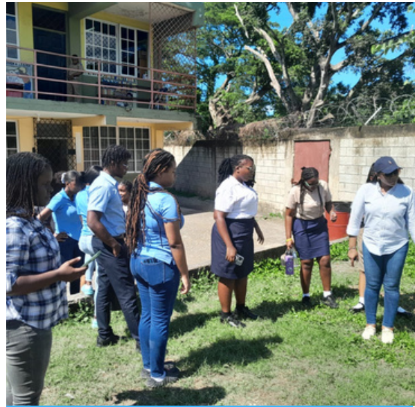
Faculty and students join forces with Catherine Hall Primary School to plant trees and nurture a greener future.

The initiative brought together faculty members, students, and school staff to plant a variety of trees on the school grounds, fostering a sense of environmental responsibility among the students.