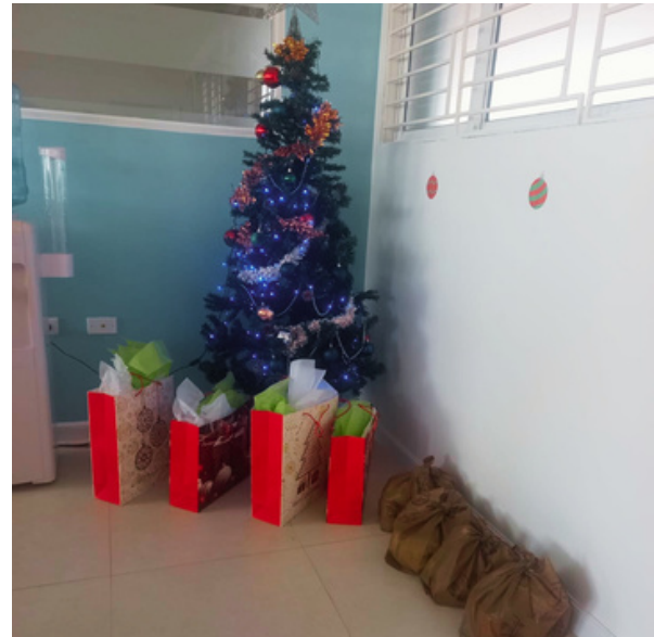
Care packages prepared with donations by members of the faculty along with students.

Thank you to everyone who contributed to making this outreach a success, and we look forward to continuing our community-focused efforts in the New Year.